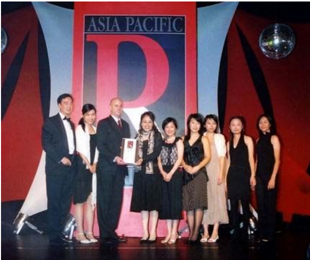
The Corporate Communication Department of NWS Holdings was honoured in the Asia Pacific PR Awards 2005.