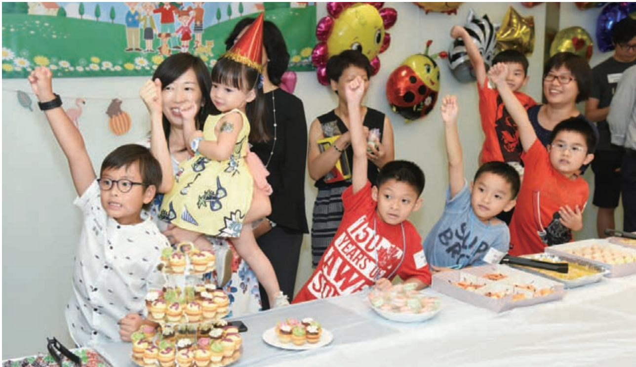
Employees' children take part in games during the NWS Family Visit Day.

Talent is the Group's most important asset. Our people are the driving force behind our success, delivering business results and enhancing operational efficiency. We strive to recruit and retain high-calibre talent, to strengthen our workforce. Our approach to people management comprises broadening of the talent-recruitment platform, providing competitive remuneration and benefits, fostering professional training and development, and promoting a healthy work-life balance. Across our operations, we are consistently building a safe, inclusive and caring workplace.