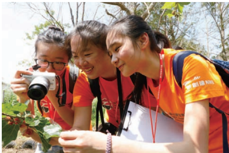
Young Ambassadors for Geoconservation closely examine ecological features in East Taiwan.

The wider NWS Hong Kong Geo Wonders Hike campaign also included