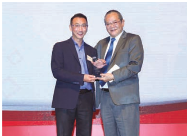
A construction subcontractor is recognized for their outstanding performance in environmental protection.

growing popularity of breastfeeding in Hong Kong, NWFF launched the first breastfeeding room on Hong Kong public transport in June 2016. Similar facilities are now available on three other three-storey ferries. Priority seats for nursing mothers on fast ferries have already launched in September 2017.