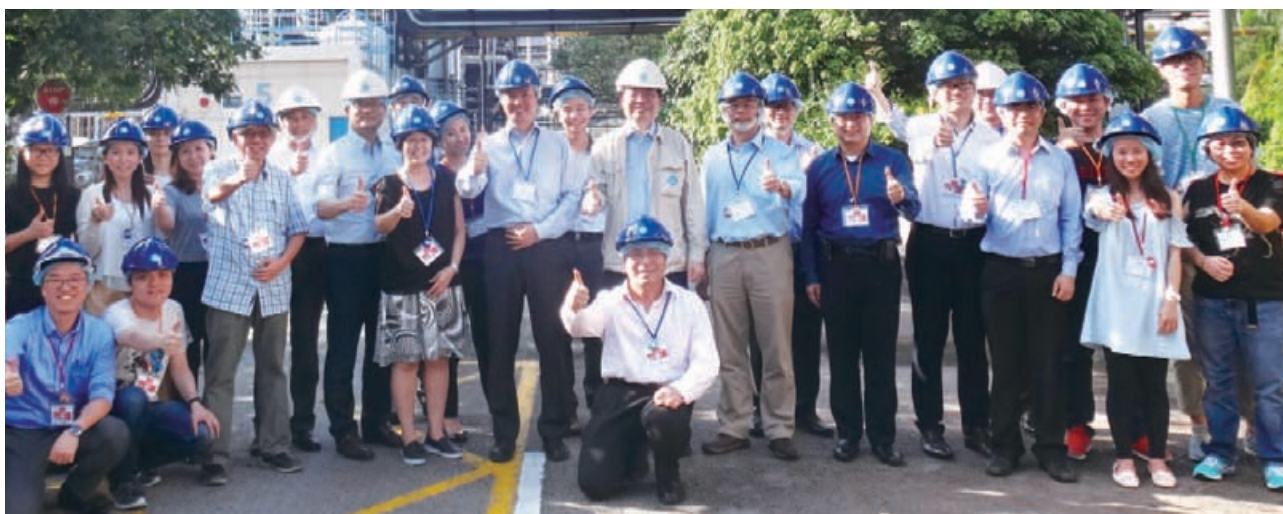
The Group's management and Green Managers visit environmental projects to build new knowledge.

examination and was webcast live to reach a broader audience of staff. The seminar covered the business outlook for Hong Kong and Mainland China and the impact of global economic policies; opportunities and risks presented by an aging market; and waste and resources management in building a smart city.