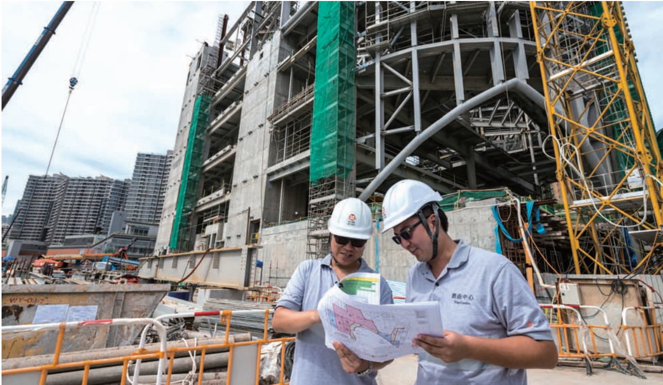
Together with our partners and suppliers, we build many of Hong Kong's iconic landmarks, including Xiqu Centre in West Kowloon.

As we manage the environmental and social risks throughout our value chain, it is essential that we communicate our principles to our partners, provide clear guidance on our expectations, and establish mechanisms to ensure legal and regulatory compliance. We also create new initiatives for our suppliers, customers and other stakeholders to contribute to sustainability endeavours. We actively engage customers and clients as part of the process to enhance the scope and quality of our services.