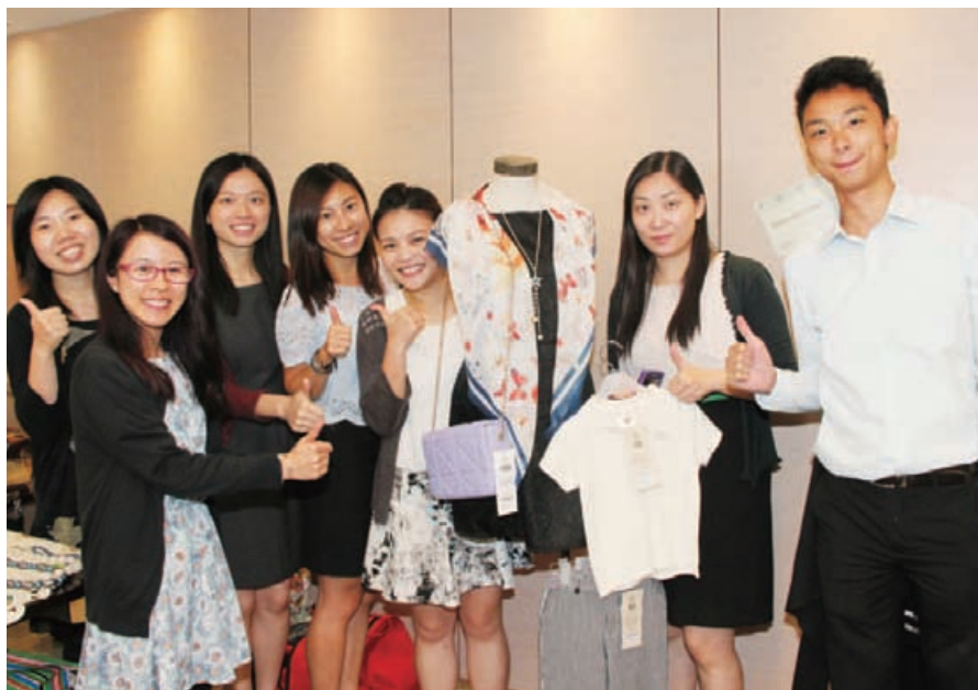
The Eco Bazaar in NWS Corporate Office promotes sustainable fashion to staff members.

The FY2017 employee green campaign focused on "Sustainable Procurement and Consumption", encouraging employees to source and consume sustainably, both at work and at home. Apart from organizing a site visit to town gas production plant for Green Managers, we held a series of light-hearted activities to promote sustainable consumption as part of everyday life.