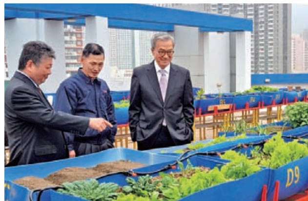
The Group's CEO, Tsang Yam Pui, takes a tour of Citybus' new rooftop organic farm, which is built out of unwanted equipment and bus parts.

The new rooftop organic farm at the Citybus depot is a new example of our creative use of waste. Set up in FY2017, the staff farm is topped with soil excavated from Hip Hing's construction sites, with planters and facilities built from old bus components and used containers. Small windmills and solar panels are deployed to power a rainwater collection and sprinkler system. Fertilizers composted from food waste help plants grow.