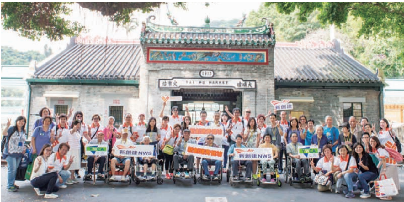
Our corporate volunteers take senior citizens on an outing to the Hong Kong Railway Museum in Tai Po.

The Group and YWCA kept the momentum of volunteering going in March 2017 by launching a new, two-year initiative named the “We Care-Elderly Friendly Community Programme”. Home visits, community events and educational videos will be used to foster a better public understanding of common health conditions affecting the elderly.