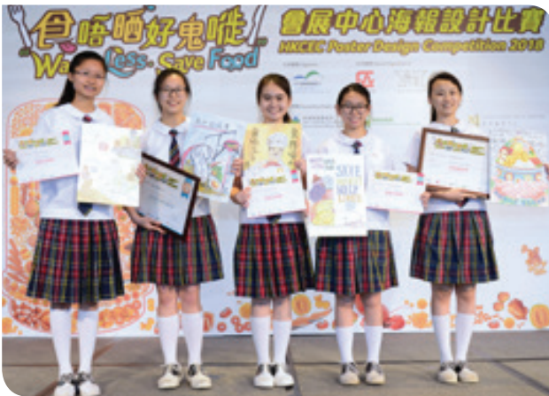
The Waste Less • Save Food HKCEC Poster Design Competition, organized by HML, unleashed students' creativity on poster and slogan design to promote the importance of reducing food waste at source.

separation, waste reduction and recycling. HML was among the first companies in Hong Kong to deliver food waste to the Government's Organic Resources Recovery Centre Phase 1, which opened in 2018. While effective food waste handling is beneficial, consumer education is critical to the success of food waste reduction. To this end, HML has organized a poster design competition to raise awareness among students, event visitors and patrons of HKCEC restaurants. In FY2018, over 10 tonnes of treated food waste were diverted from landfills, with over two tonnes of unconsumed but still perfectly edible food donated to the needy.