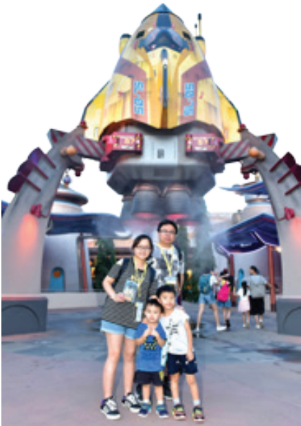
Over 8,000 local staff and their family members enjoy a trip to Hong Kong Disneyland for quality family time.